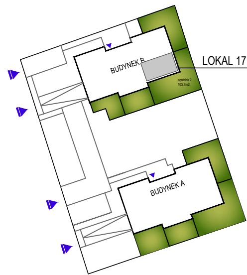
SCHEMAT RZUTU PARTERU